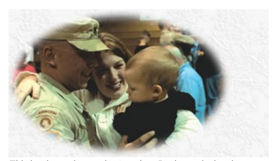
This is what makes up the American Legion and what the American Legion lives for.

NON-PROFIT ORGANIZATION U.S. POSTAGE PAID COLORADO SPGS, CO PERMIT NO. 192