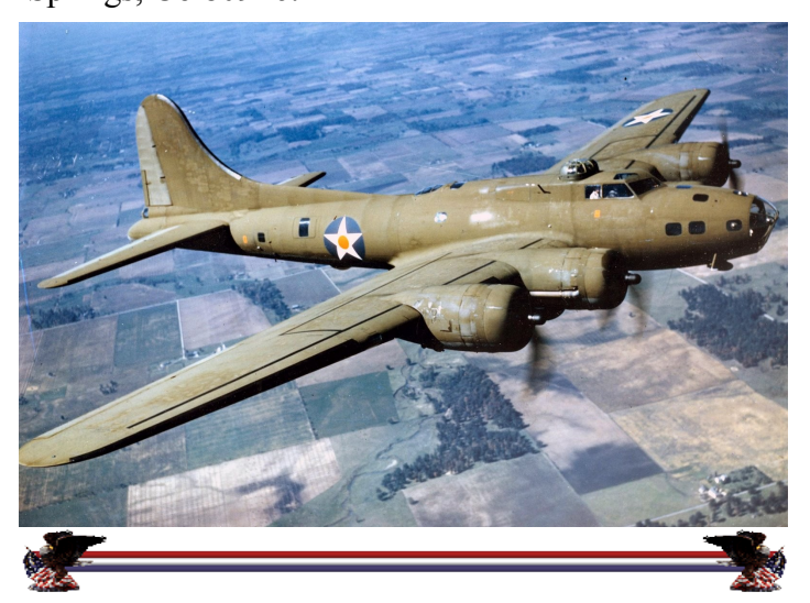
The Patriot Flag

The Commemorative Air Force is flying in a B-17G to the Colorado Springs Airport and CUTTER AVI-ATION on 8 August, and it will be there through 14 August to participate in the reunion of the 381st BG Veterans who flew B-17s in World War II. A walk through tour of the B-17G is free to all World War II Veterans, active duty military and Cadet's in uniform. There are also walk through tours for adults at $5.00 per adult and $3.00 for children. Cutter Aviation is located at 1360 Aviation Way, Colorado Springs, Co 80916.