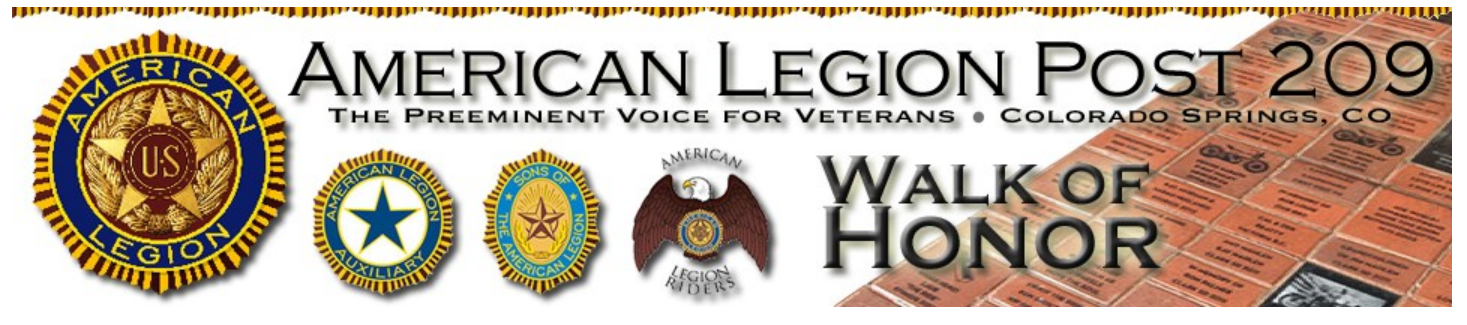
Buy A Brick Fundraiser!

If you have attended some of our meetings over the past several months, you may have heard us discuss plans for a new fundraising effort. We are partnering with Polar Engraving to offer our members, family, friends, and our corporate Veteran-friendly supporters an opportunity to purchase an engraved brick to adorn our landscaping project we are working. The bricks are engraved using a hybrid method that combines both laser engraving and sandblasting. The engraving is then painted using the same paint used on tombstones so it's extremely durable. Here are the details/answers to questions we anticipate: