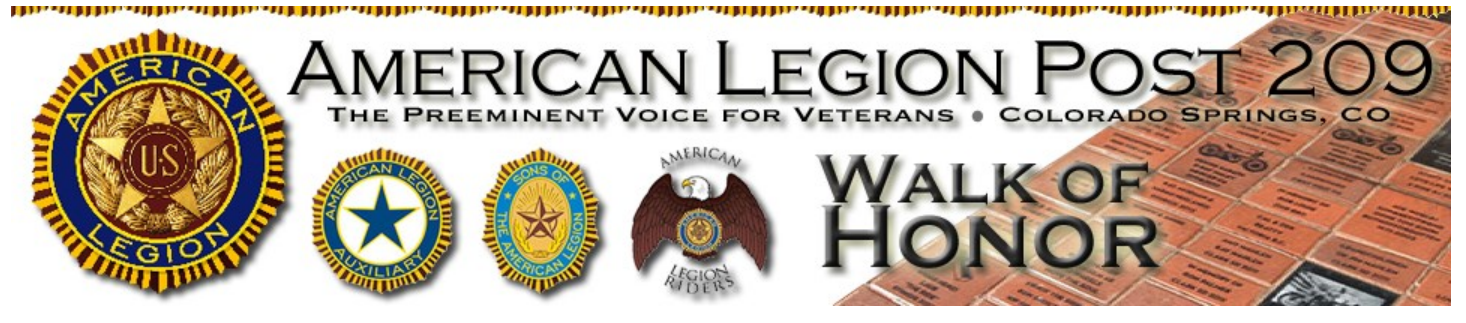
Buy A Brick Fundraiser!

If you have attended some of our meetings over the past several months, you may have heard us discuss plans for a new fundraising effort. We are partnering with Polar Engraving to offer our members, family, friends, and our corporate Veteran-friendly supporters an opportunity to purchase an engraved brick to adorn our landscaping project we are working. The bricks are engraved using a hybrid method that combines both laser engraving and sandblasting. The engraving is then painted using the same paint used on tombstones so it's extremely durable. Here are the details/answers to questions we anticipate: