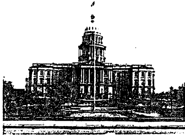
This site on the west grounds of the State Capitol was authorized unanimously by the 1984 Colorado Legislature. Looking eastward from across Broadway Avenue, the State Capitol is in the background with Lincoln Avenue at the base of the hill.

Since May 1983 there has evolved a unique co-operative citizen/government effort to construct the COLORADO TRIBUTE TO VETERANS on the grounds of the State Capitol — something that has not been done by Colorado since the Spanish-American War in 1898. The State of Colorado provided the site, proclaimed the design competition, will supervise the entire construction process and will take over possession and maintenance upon dedication. The Colorado Tribute to Veterans Fund , an all volunteer, non-profit, private corporation, selected the TRIBUTE design and is organizing the $495,000 fundraising effort of which over 90% will go for construction. If you want to express your gratitude and respect for the men and women whose proud service and brave sacrifice has kept our nation strong and free, send your tax-deductible donation today. We can not succeed in this long overdue project to be financed entirely by private contribution without you!